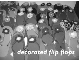
decorated flip flops

The gifts have varied as needs are known. The first projects included rolled bandages, layettes, girls' dresses and scripture cards for Tandala Hospital in Congo. More recently the circle has provided fleece blankets, hand knit dolls, decorated flip flops, hanging towels with crocheted tops, hot mats, aprons, coasters, covered hangars, hand crocheted baskets...and much more.